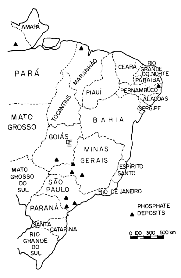
Fig. 2 — Phosphate mines and deposits in Brazil (from de Lima, 1976). The deposit in the Maecuru River valley is from Beisiegel & de Souza, 1986.

Large expanses of pasture can be expected to be subject to disease and insect outbreaks in the same way as other large monocultures. Switching the grass varieties planted can counter such problems to some extent, but the cost and frequency of expected to insuch changes can be crease. Brachiaria decumbens (braquiária), a pascommon on formerly the ture grass Belém-Brasília Highway, was devastated in the early 1970s by outbreaks of the homopteran known as cigarrinha (Deois incompleta Ceropidae). Guinea grass or colonião (Panicum maximum) became a favorite in the area, and its performance was described by EMBRAPA as